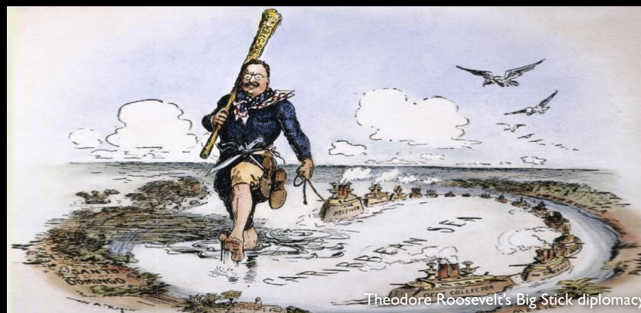
W.A. Rogers