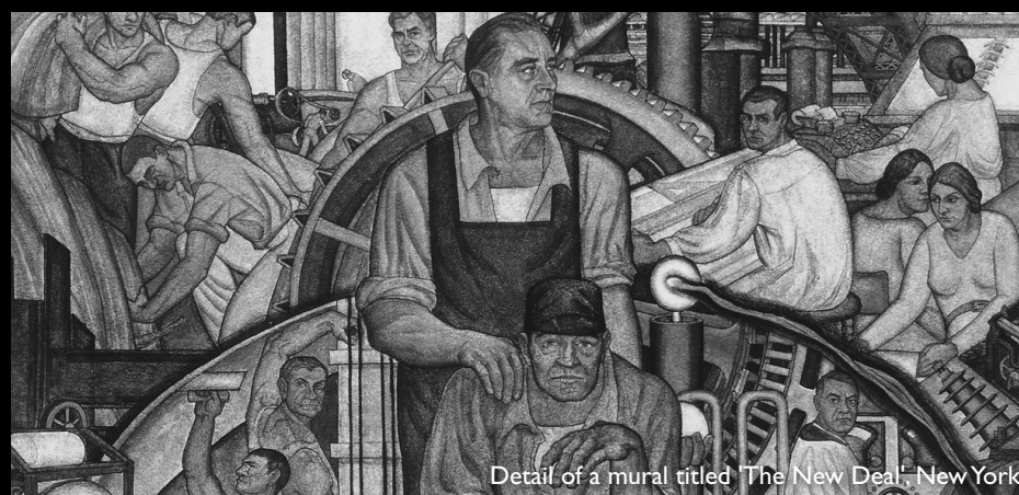
Conrad A. Albrizio / U.S. NARA / Public domain