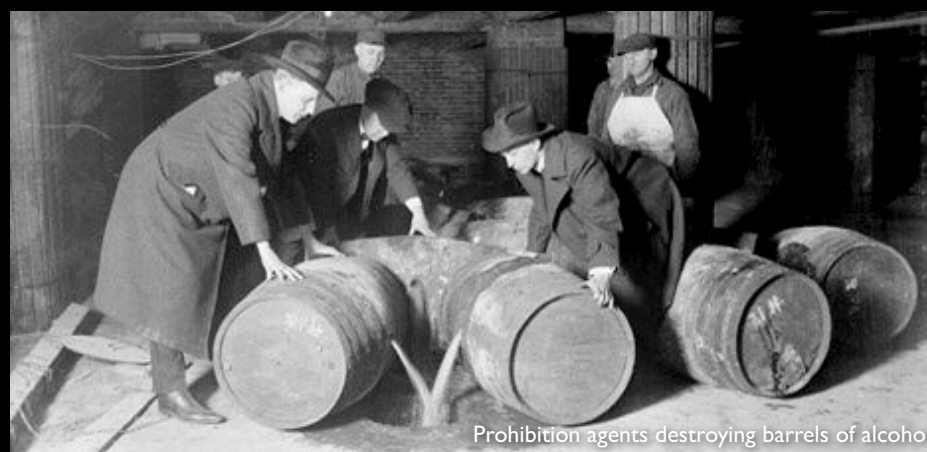
Prohibition agents destroying barrels of alcohol