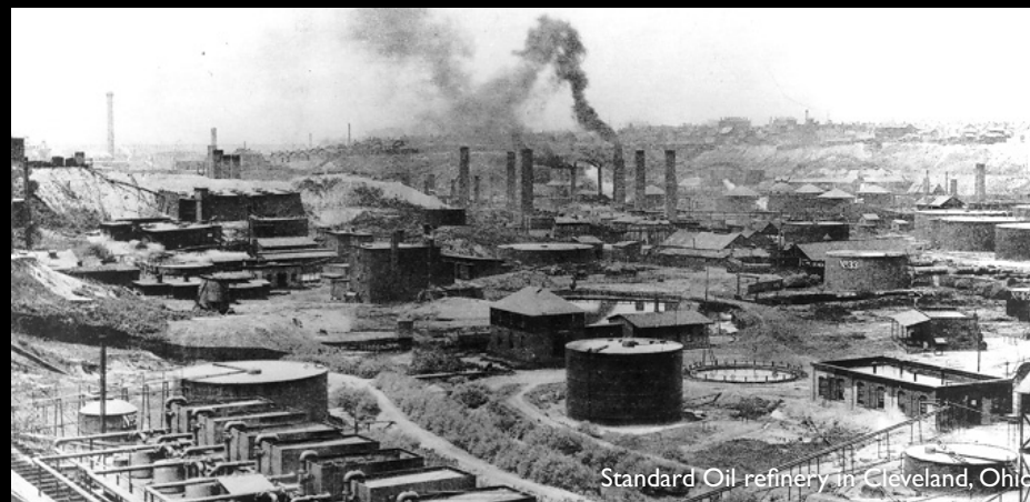
Standard Oil refinery in Cleveland, Ohio